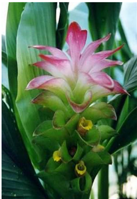
Fig. 1 C. xanthorrhiza Roxb. It is a ginger-like plant of the family Zingiberaceae . The flowers are generally yellow, where the sheath is yellow and the aerial part is purple

There are several methods used to extract the essential oil and XNT including supercritical fluid carbon dioxide extraction (SCFE-CO 2 ), Soxhlet extraction and percolation process [8]. According to Salea and colleagues (2014), SCFE-CO 2 at factor combination of pressure 15 MPa, temperature 50 °C, flow rate 15 g/min and duration 60 min, has the highest XNT compared to Soxhlet and percolation extraction system. Before the introduction of SCFE-CO 2 , many researchers [6, 12–20] were still using conventional solvent extraction method to isolate XNT. Since the cost production of using SCFE-CO 2 is much higher than conventional method, we suggest that SCFE-CO 2 is more applicable in large-scale production in the industry.